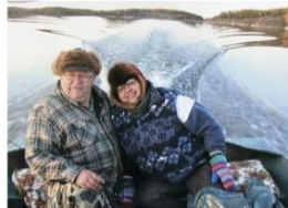
My parents, enjoying each other on the Taltson River east of Fort Smith.

After a long day on his trapline, dad would tend to the fur while mom would sew late into the evenings. She became a well respected and expert sewer of fur and hides. My parents kept our large family well fed and healthy with wild meat. We were dressed in the warmest of furs. The six "little Dragons" were northern kids who didn't know the meaning of cold!